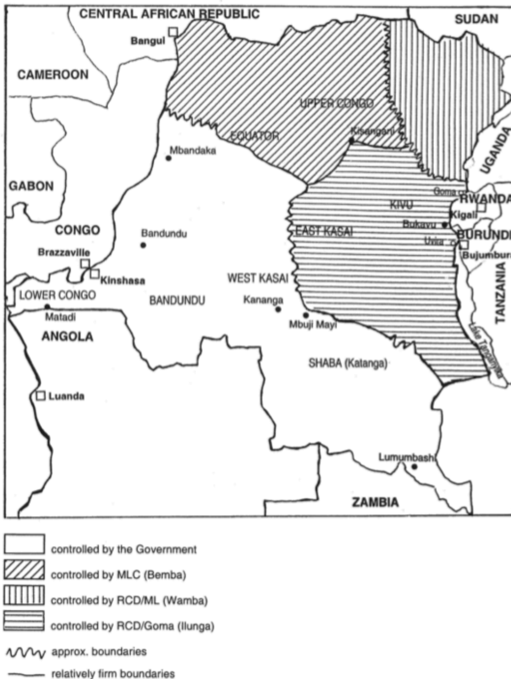
The Politico-Military Zones of the Democratic Republic of the Congo—January 2000